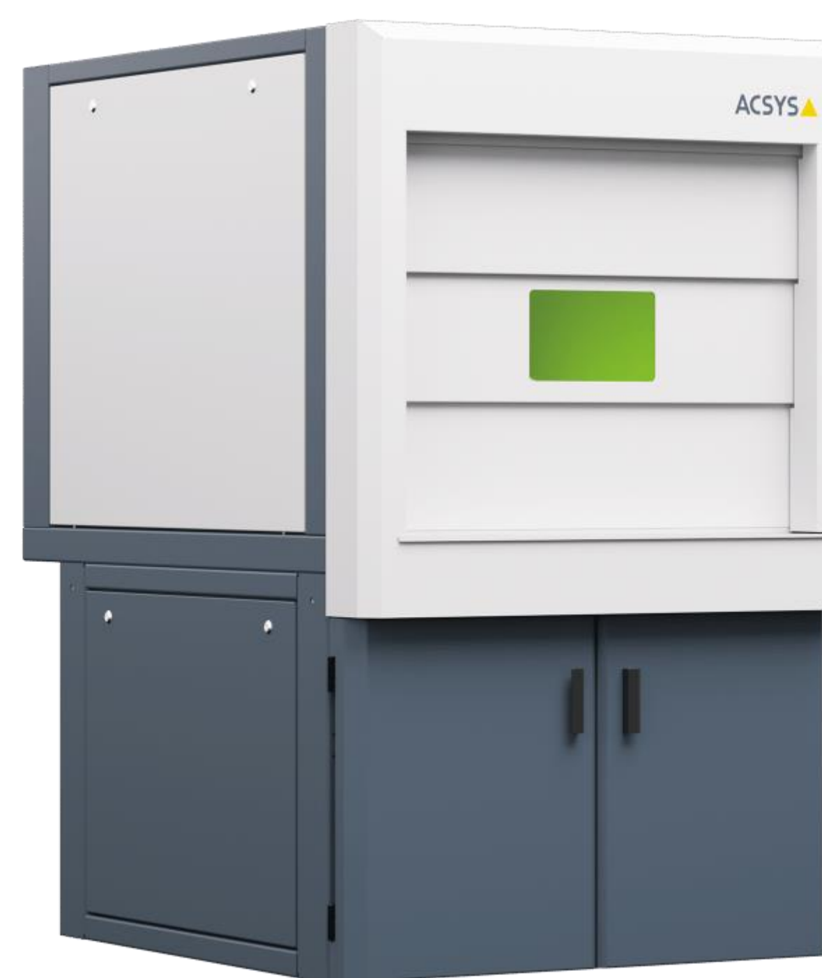
LASER System [2]