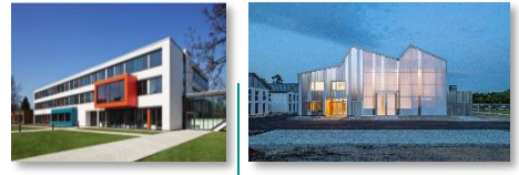
Institute for Automation and Applied Informatics (IAI)