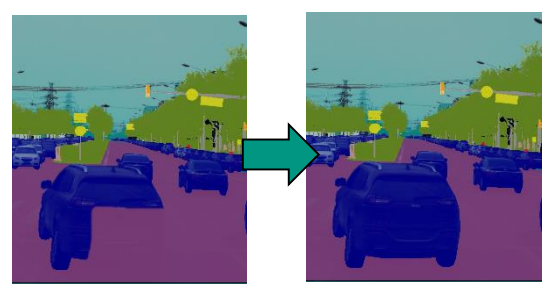
Example 1: An urban street shot. The car in the middle is segmented contradictory to the general assumption regarding the shape of cars.

Modern deep learning architectures require large amounts of data to obtain satisfying results. This raises issues in image recognition, as datasets are generally small-scale, challenging to obtain, and expensive to annotate. Therefore, datasets are often only partially annotated. To improve training with such incomplete data one can penalize contradictions in the training process. Within semantic segmentation this can mean that a generated mask must be assigned a unique class even if not all annotations are given [1]. For example, we know for certain that a car cannot be located in a place where a semantic annotation for the sky is given. The challenge of this master thesis is to compare and develop methods that improve and stabilize the training process with partially annotated data. This could mean to punish contradictory or inconsistent behaviour by programmatically defined rules or human-in-the-loop approaches.